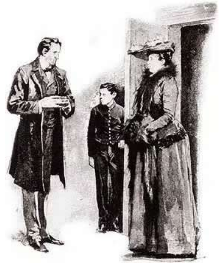
figure like a full-sailed merchant-man behind a tiny pilot boat. Sherlock Holmes welcomed her with the easy courtesy for which he was remarkable, and, having closed the door and bowed her into an armchair, he looked her over in the minute and yet abstracted fashion which was peculiar to him.

“Do you not find,” he said, “that with your short sight it is a little trying to do so much typewriting?”