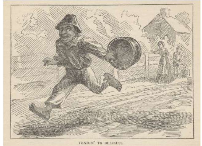
TENDIN' TO BUSINESS.

over the toe with absorbing interest while the bandage was being unwound. In another moment he was flying down the street with his pail and a tingling rear, Tom was whitewashing with vigor, and Aunt Polly was retiring from the field with a slipper in her hand and triumph in her eye.