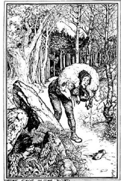
THE SHOE IN THE ROAD

'Why, it must have got its feet loose, and have strayed after all,' thought the man; and he put the kid on the grass and hurried off in the direction of the bleating. Then the boy ran back and picked up the kid, and took it to the Black Gallows Bird.