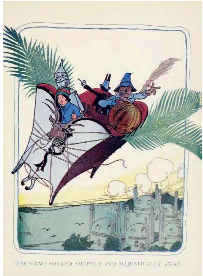
THE GUMP SOARED SWIFTLY AND MAJESTICALLY AWAY.

"And yet," continued the Thing, "when I carefully look you over, my masters, none of you seems to be constructed much more artistically than I am."