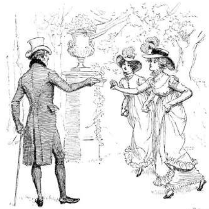
"But perhaps you would like to read it"

Elizabeth read on: "I have seen them both. They are not married, nor can I find there was any intention of being so; but if you are willing to perform the engagements which I have ventured to make on your side, I hope it will not be long before they are. All that is required of you is, to assure to your