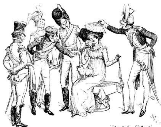
"Tenderly flirting"

Elizabeth was now to see Mr. Wickham for the last time. Having been frequently in company with him since her return, agitation was pretty well over; the agitations of former partiality entirely so. She had even learnt to detect, in the very gentleness which had first delighted her, an affectation and a sameness to disgust and weary. In his present behaviour to herself,