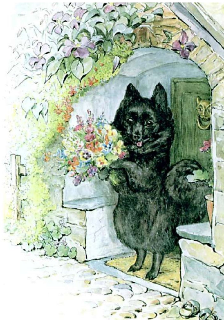
DUCHESS IN THE PORCH

"Quite well, I thank you, and how do you do, my dear Ribby?" said Duchess. "I've brought you some flowers; what a delicious smell of pie!"