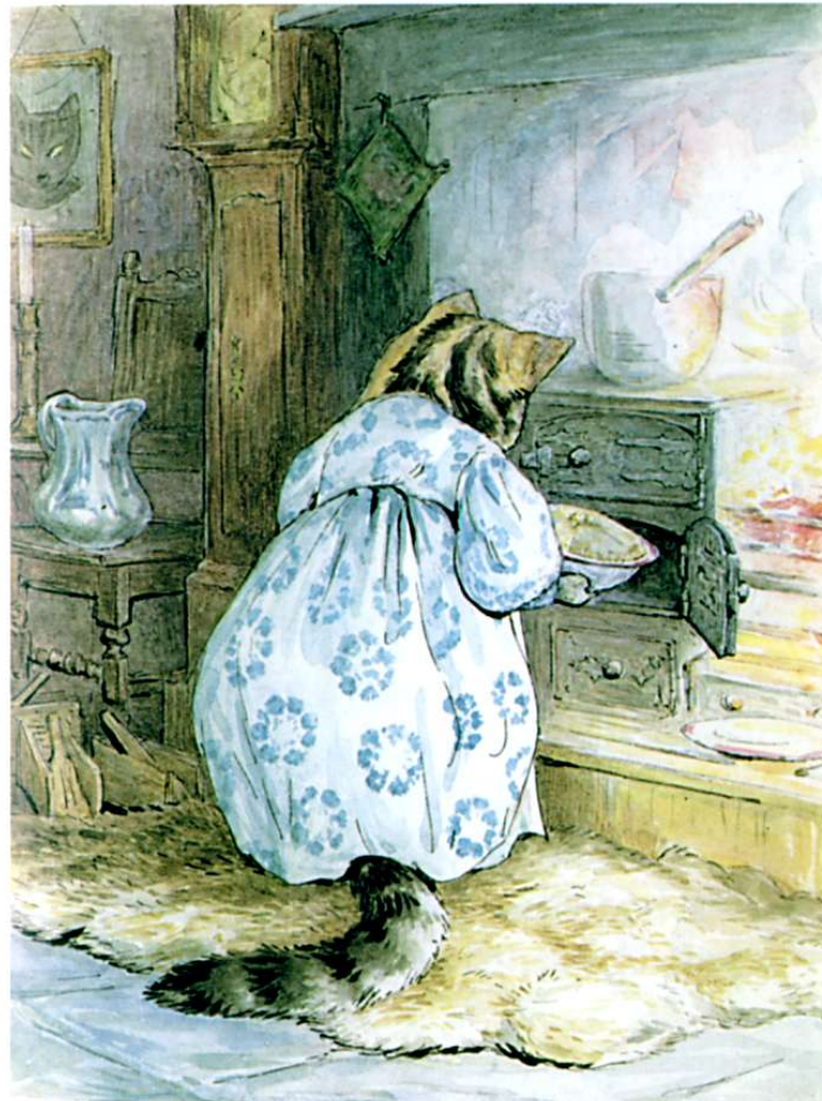
THE PIE MADE OF MOUSE

Duchess was quite delighted with her own cleverness! Ribby in the meantime had received Duchess's answer, and as soon as she was sure that the little dog could come—she popped her pie into the oven. There were two ovens, one above the other; some other knobs and handles were only ornamental and not intended to open. Ribby put the pie into the lower oven; the door was very stiff.