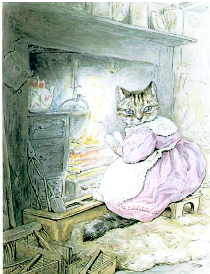
READY FOR THE PARTY

She came downstairs again, and made the tea, and put the teapot on the hob. She peeped again into the bottom oven, the pie had become a lovely brown, and it was steaming hot. She sat down before the fire to wait for the little dog. "I am glad I used the bottom oven," said Ribby, "the top one would certainly have been very much too hot. I wonder why that cupboard door was open? Can there really have been someone in the house?"