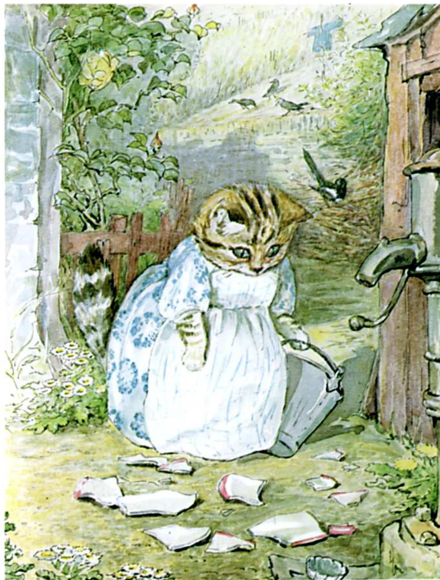
SO THERE REALLY WAS A PATTY-PAN

When Ribby came out for a pailful of water to wash up the tea-things, she found a pink and white pie-dish lying smashed in the middle of the yard. The patty-pan was under the pump, where Dr. Maggotty had considerately left it.