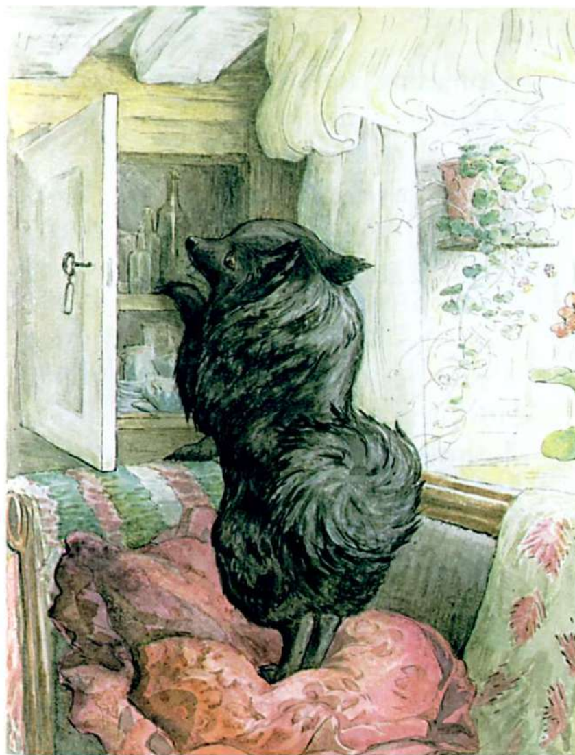
WHERE IS THE PIE MADE OF MOUSE ?

Ribby went on to Timothy Baker's and bought the muffins. Then she went home. There seemed to be a sort of scuffling noise in the back passage, as she was coming in at the front door. "I trust that is not that Pie: the spoons are locked up, however," said Ribby. But there was nobody there. Ribby opened the bottom oven door with some difficulty, and turned the pie. There began to be a pleasing smell of baked mouse!