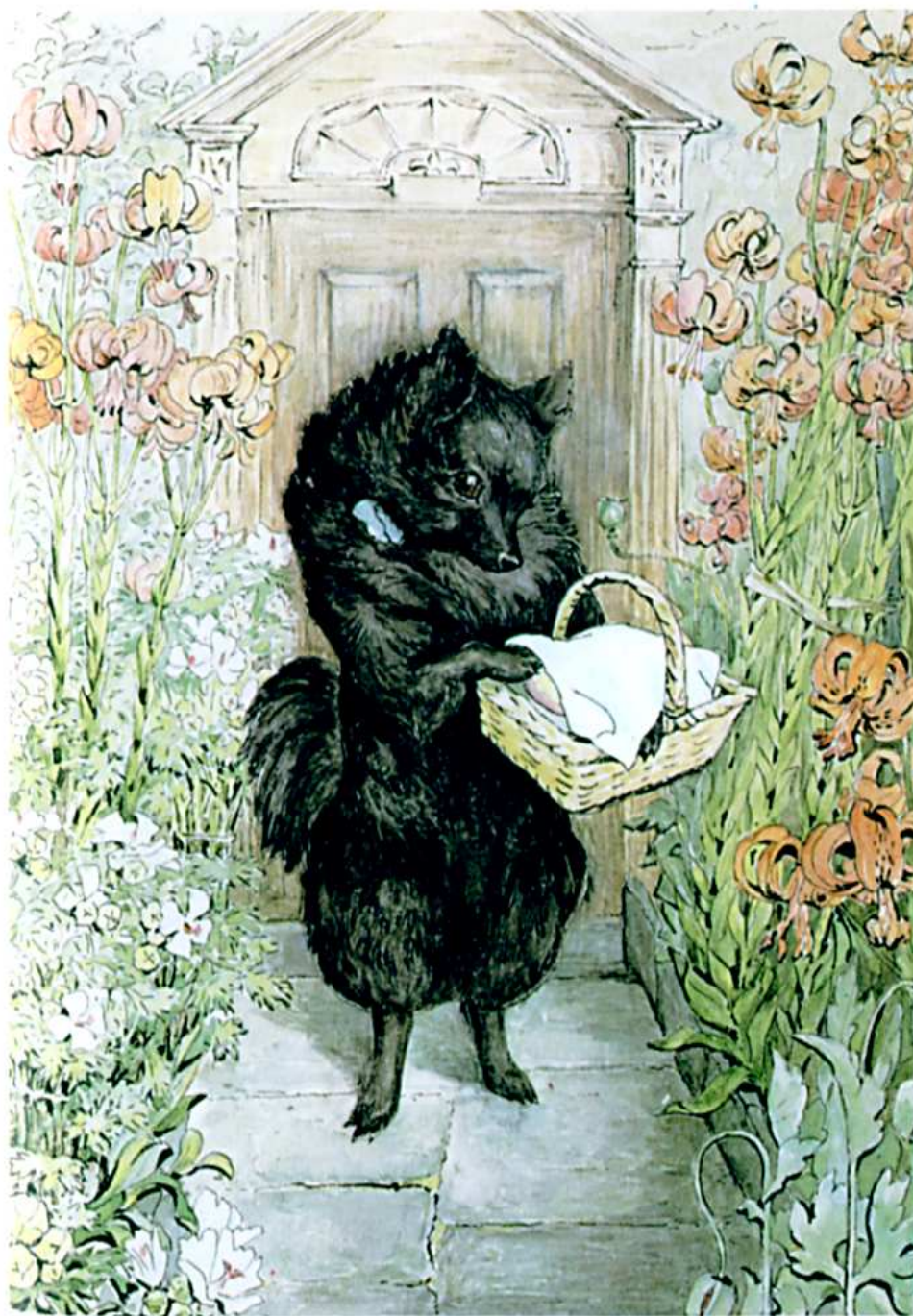
THE VEAL AND HAM PIE

And just at the same time, Duchess came out of her house, at the other end of the village.