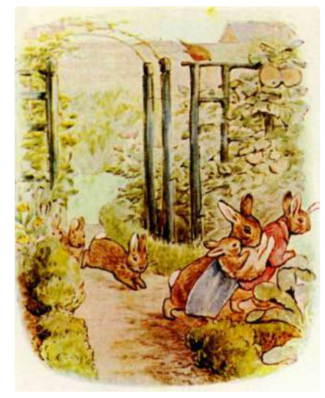
Page 26 of 28

Then Benjamin and Flopsy thought that it was time to go home.