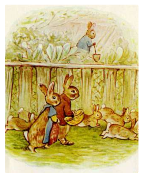
Page 5 of 28