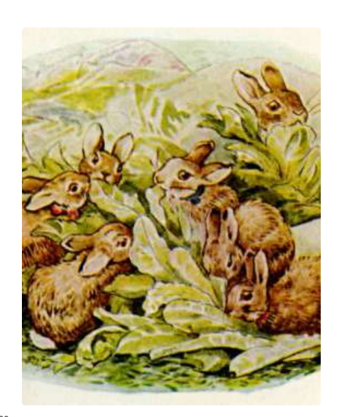
Page 8 of 28

The Flopsy Bunnies simply stuffed lettuces. By degrees, one after another, they were overcome with slumber, and lay down in the mown grass.