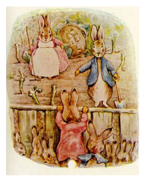
Page 6 of 28

Mr. McGregor's rubbish heap was a mixture. There were jam pots and paper bags, and mountains of chopped grass from the mowing machine (which always tasted oily), and some rotten vegetable marrows and an old boot or two. One day—oh joy!—there were a quantity of overgrown lettuces, which had "shot" into flower.