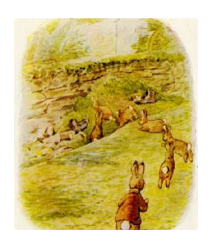
Page 7 of 28

Mr. McGregor's rubbish heap was a mixture. There were jam pots and paper bags, and mountains of chopped grass from the mowing machine (which always tasted oily), and some rotten vegetable marrows and an old boot or two. One day—oh joy!—there were a quantity of overgrown lettuces, which had "shot" into flower.