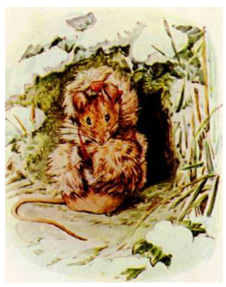
Page 27 of 28

Then Benjamin and Flopsy thought that it was time to go home.