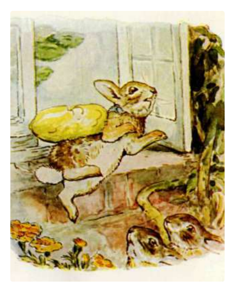
Page 25 of 28

When she felt the vegetables she became very very angry. She said that Mr. McGregor had "done it a purpose."