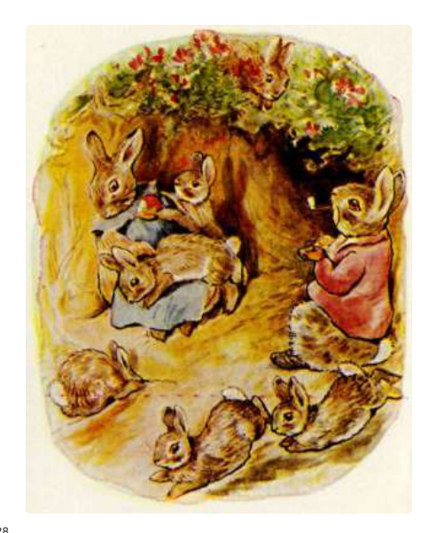
Page 4 of 28

When Benjamin Bunny grew up, he married his Cousin Flopsy. They had a large family, and they were very improvident and cheerful. I do not remember the separate names of their children; they were generally called the "Flopsy Bunnies."