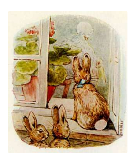
Page 24 of 28

"Rabbit tobacco! I shall skin them and cut off their heads."