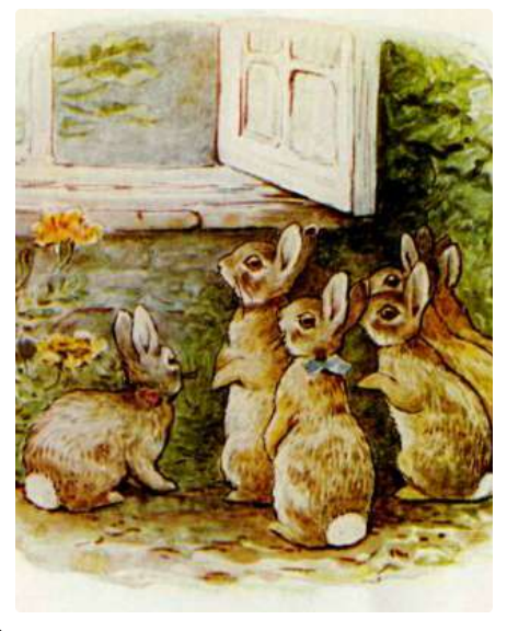
Page 22 of 28

"One, two, three, four, five, six leetle rabbits!" said Mr. McGregor.