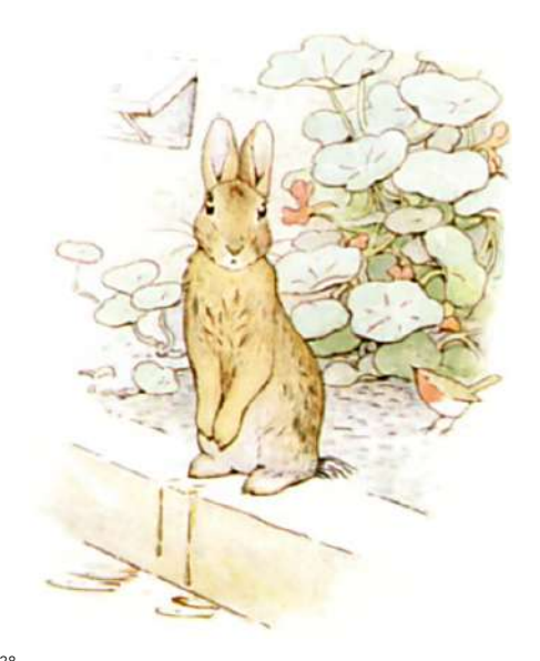
Page 20 of 28

After a time he began to wander about, going lippity—lippity—not very fast, and looking all round.