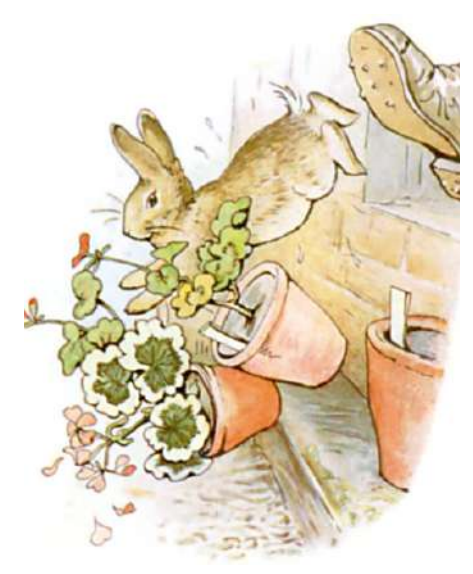
Page 19 of 28

And tried to put his foot upon Peter, who jumped out of a window, upsetting three plants. The window was too small for Mr. McGregor, and he was tired of running after Peter. He went back to his work.