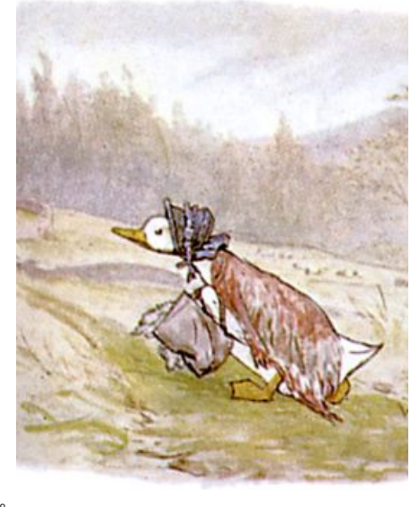
Page 22 of 28

She flew over the wood, and alighted opposite the house of the bushy long-tailed gentleman.