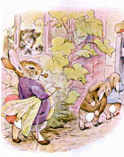
Page 25 of 27

Then he took out the handkerchief of onions, and marched out of the garden.