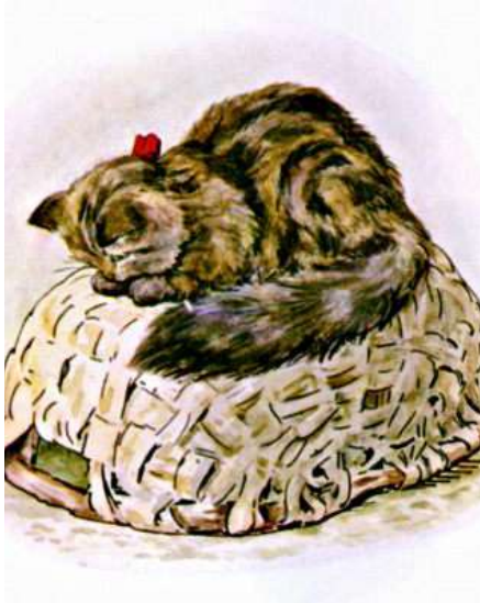
Page 21 of 27

The sun got round behind the wood, and it was quite late in the afternoon; but still the cat sat upon the basket.