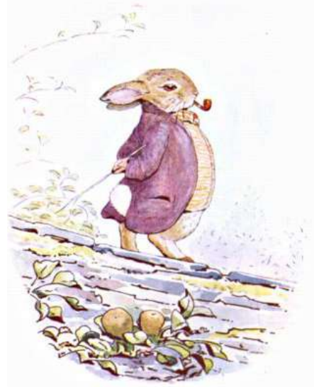
Page 22 of 27

Old Mr. Bunny had no opinion whatever of cats.