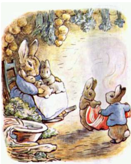
Page 27 of 27