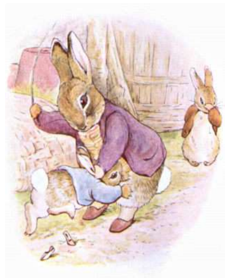
Page 24 of 27