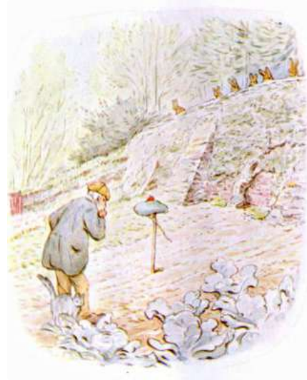
Page 26 of 27

When Mr. McGregor returned about half an hour later he observed several things which perplexed him. It looked as though some person had been walking all over the garden in a pair of clogs—only the footmarks were too ridiculously little! Also he could not understand how the cat could have managed to shut herself up inside the greenhouse, locking the door upon the outside.