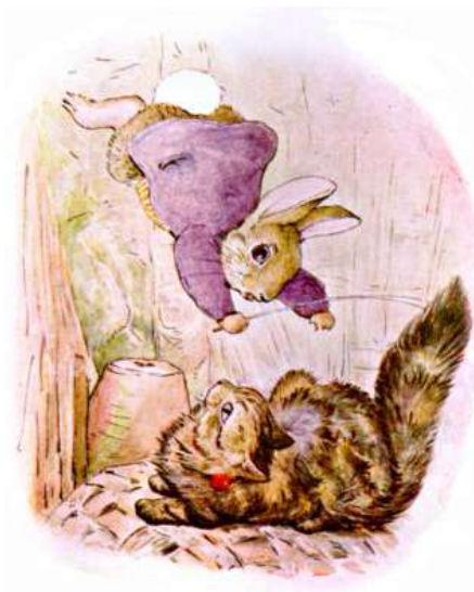
Page 23 of 27

The cat was too much surprised to scratch back.