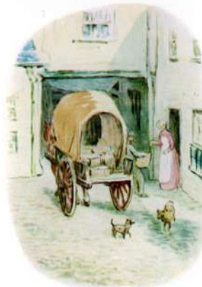
Page 6 of 28

At last the cart stopped at a house, where the hamper was taken out, carried in, and set down. The cook gave the carrier sixpence; the back door banged, and the cart rumbled away. But there was no quiet; there seemed to be hundreds of carts passing. Dogs barked; boys whistled in the street; the cook laughed, the parlour maid ran up and down-stairs; and a canary sang like a steam engine.