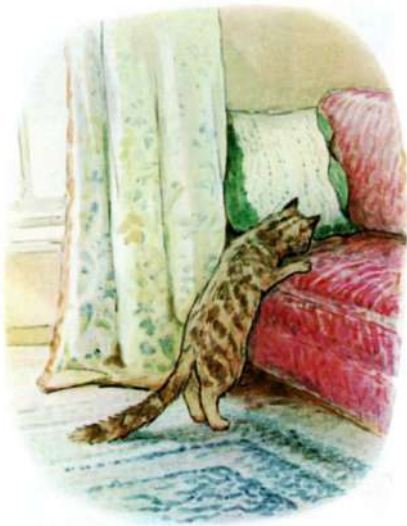
Page 13 of 28

"No? Would you rather go to bed? I will show you a most comfortable sofa pillow."