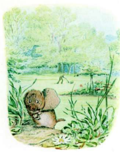
Page 26 of 28

"That is only the lawn-mower; I will fetch some of the grass clippings presently to make your bed. I am sure you had better settle in the country, Johnny."