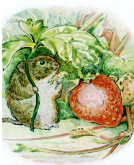
Page 28 of 28

One place suits one person, another place suits another person. For my part I prefer to live in the country, like Timmy Willie.