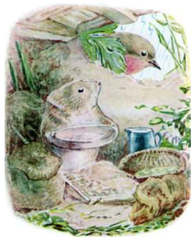
Page 16 of 28

Timmy Willie longed to be at home in his peaceful nest in a sunny bank. The food disagreed with him; the noise prevented him from sleeping. In a few days he grew so thin that Johnny Town-mouse noticed it, and questioned him. He listened to Timmy Willie's story and inquired about the garden. "It sounds rather a dull place? What do you do when it rains?"