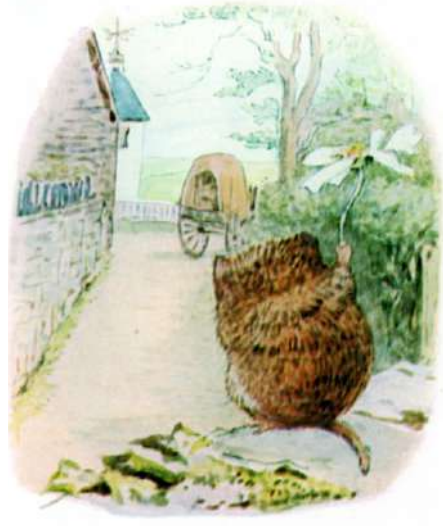
Page 14 of 28

The sofa pillow had a hole in it. Johnny Town-mouse quite honestly recommended it as the best bed, kept exclusively for visitors. But the sofa smelt of cat. Timmy Willie preferred to spend a miserable night under the fender.