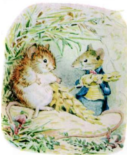
Page 27 of 28

"I am sure you will never want to live in town again," said Timmy Willie.