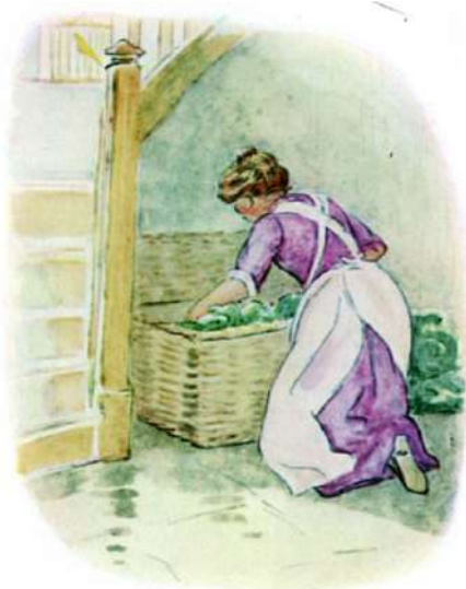
Page 7 of 28

Timmy Willie, who had lived all his life in a garden, was almost frightened to death. Presently the cook opened the hamper and began to unpack the vegetables. Out sprang the terrified Timmy Willie.