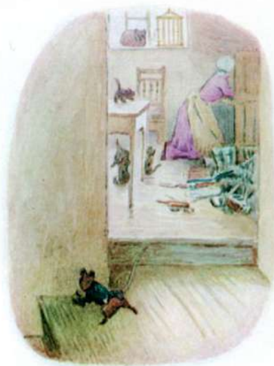
Page 25 of 28

Johnny's account was rather middling. He explained why he was paying his visit so early in the season; the family had gone to the sea-side for Easter; the cook was doing spring cleaning, on board wages, with particular instructions to clear out the mice. There were four kittens, and the cat had killed the canary.