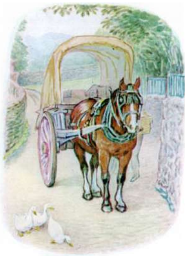
Page 5 of 28

He awoke in a fright, while the hamper was being lifted into the carrier's cart. Then there was a jolting, and a clattering of horse's feet; other packages were thrown in; for miles and miles—jolt—jolt—jolt! and Timmy Willie trembled amongst the jumbled up vegetables.