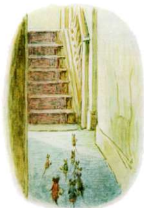
Page 15 of 28

It was just the same next day. An excellent breakfast was provided—for mice accustomed to eat bacon; but Timmy Willie had been reared on roots and salad. Johnny Town-mouse and his friends racketted about under the floors, and came boldly out all over the house in the evening. One particularly loud crash had been caused by Sarah tumbling downstairs with the tea-tray; there were crumbs and sugar and smears of jam to be collected, in spite of the cat.